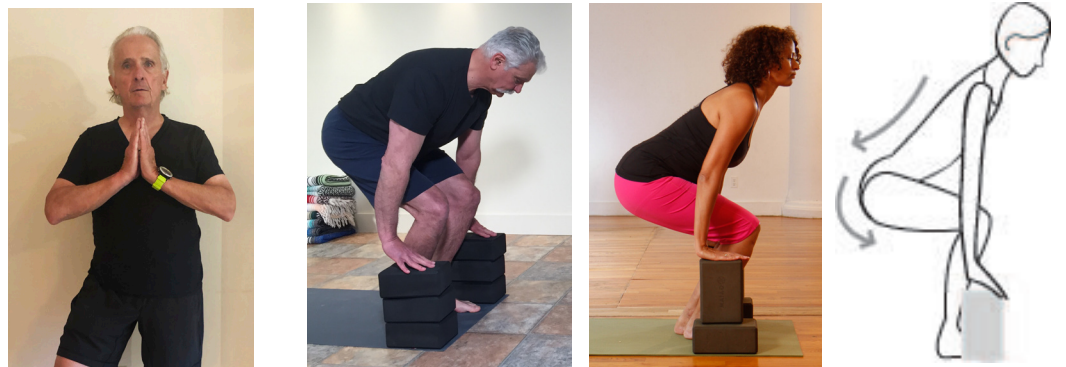
D. Chair and Block Test