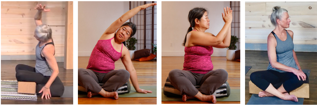
FIGURE 1. Y4C Functional Yoga Posture Assessments