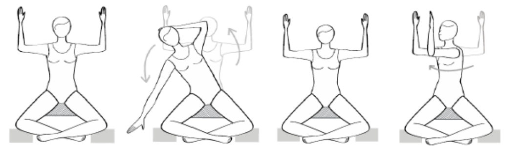
A. Warm up Vinyasa Seated