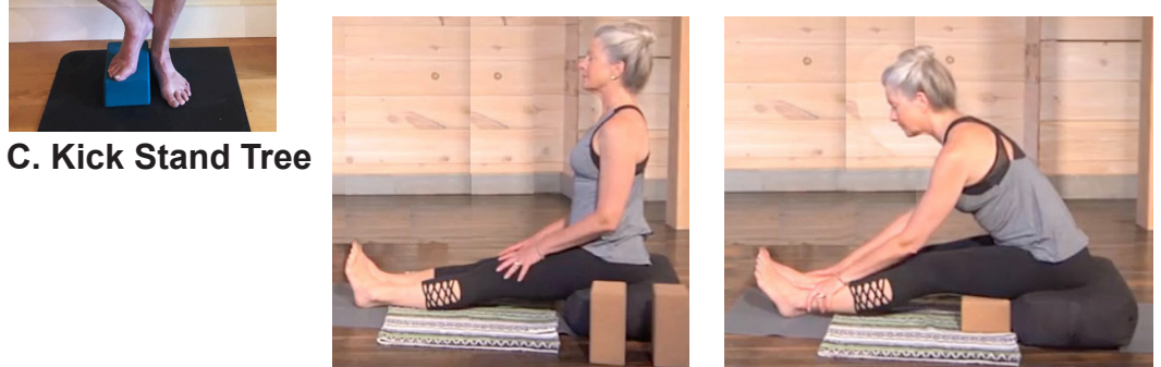
E. Forward Fold